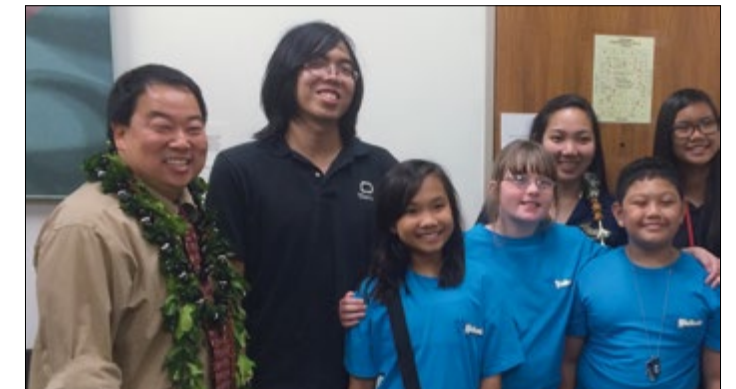
Visiting with students from Waikele Elementary School