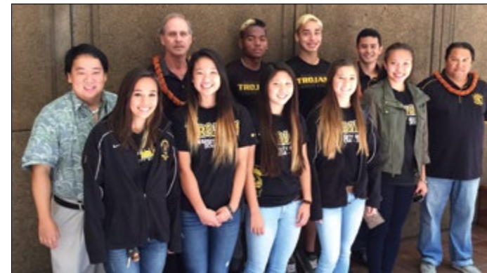
Recognizing the Mililani High School Boys and Girls State Soccer Champions at the State Capitol.