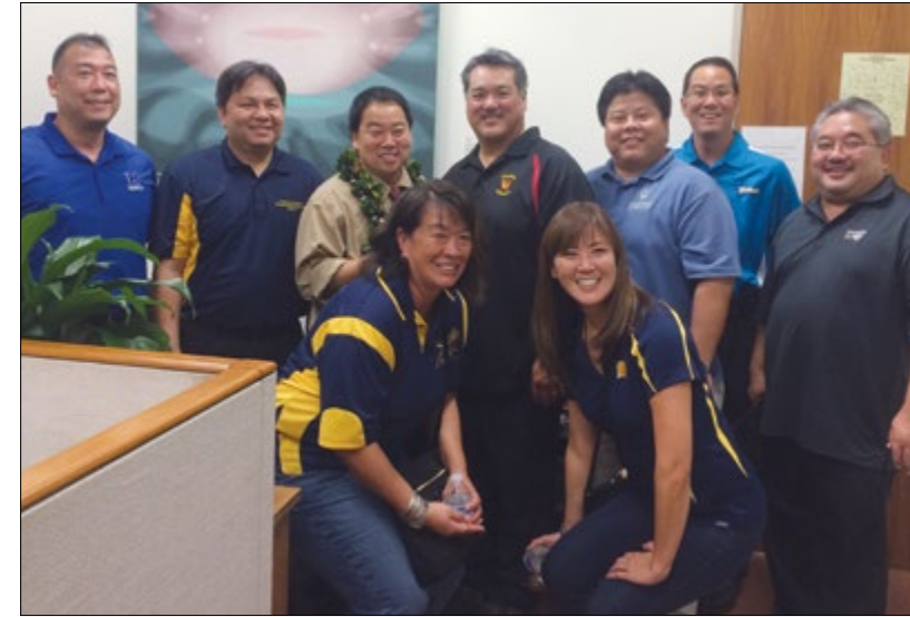
Meeting with the Waipahu complex area school principals.

Hawaii also became the first state in the nation to require a state university, our University of Hawaii, to establish a goal of becoming net-zero in energy use,