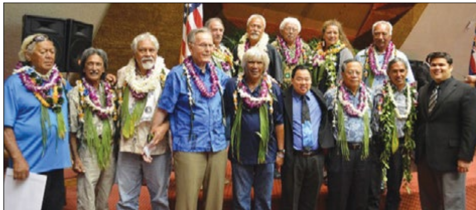
Honoring the original crew of the Hokulea on the 40th anniversary of its first voyage.