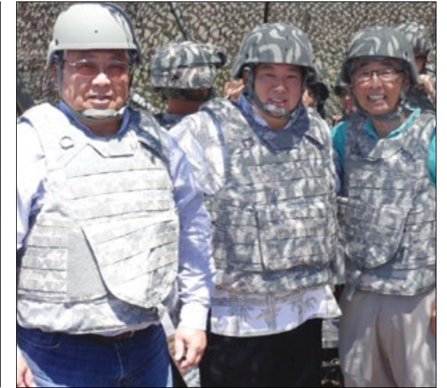
Supporting the Hawaii Army National Guard at the Pohakuloa Training Area in the Big Island.

producing as much energy as UH consumes system-wide, by January 1, 2035.