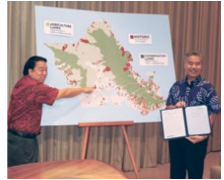
Governor Ige signs Rep. Yamane's bill into Law to protect Hawaii's homeowners.

In response to Mililani residents' problems in obtaining building permits, I introduced a bill ( Act 224 ) which successfully passed through the legislature to protect homeowners of homes which are 50 years or older from an existing and unnecessary bureaucratic system. This new law exempts homeowners with older homes from a time consuming "historical review" process when they apply for a building permit to modify their home.