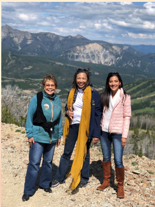
Above - In mid-July, Rep. Okimoto attended the 72nd Annual Meeting of the Council of State Governments - West in Montana, where she was able to learn and share ideas about education with other legislators from the western part of the United States.