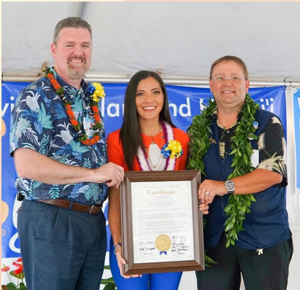
Top Left - Congratulations to Wal-Mart Mililani on their 25th Anniversary (August 2, 2019).