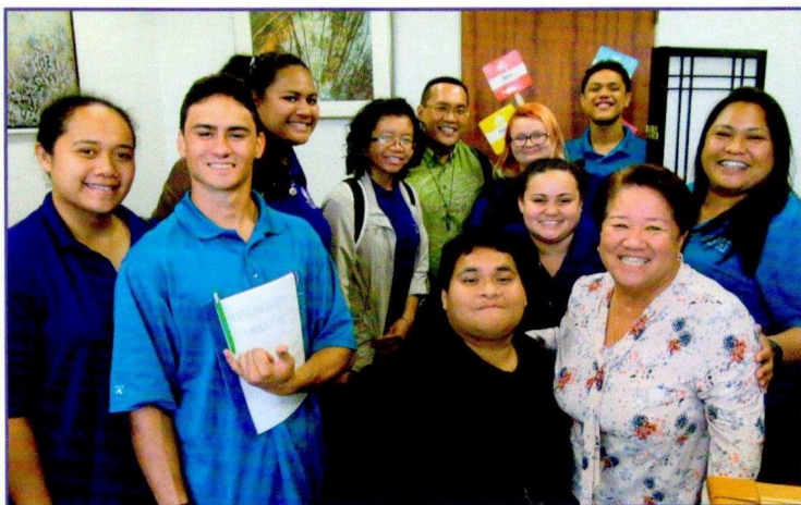
Na keiki are the future of Hawai'i and their visits to the State Capitol exemplify the care, compassion, and responsibilities they must undertake for the building of their futures. It is heartwarming to see their engagement with political issues and their visits to the State Capitol are a great starting point to learn advocacy.