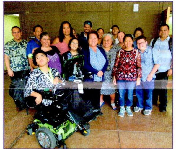
Always a pleasure to see the Kaua'i Developmental Disabilities group doing advocacy work at the State Capitol on their annual legislative visit!