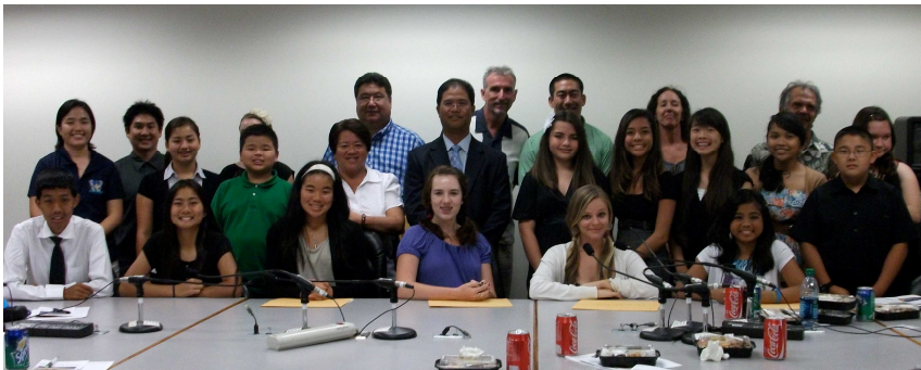
Super science students from Kauai and their teachers visited the Capitol while on a short break during the Hawaii State Science and Engineering Fair 2012.