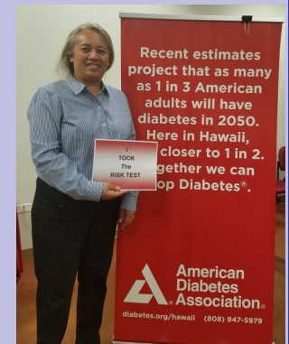
Rep. DeCoite after taking the Diabetes Risk Test.