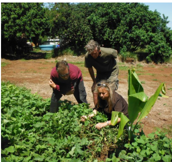
Visiting the “Teens On Call” vocational training center in Paia.