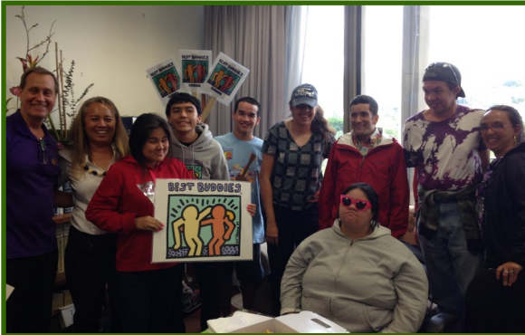
Friends and Advocates from Maui Best Buddies and Easter Seals.

March 12, 2015 was “Best Buddies” Day at the Capitol. Groups supporting individuals with Developmental Disabilities came to meet with all of the legislators and advocate for their needs. I was amazed by all of the advocates, many of whom have disabilities themselves, and the issues they wanted to discuss. The main issue was securing services to the disabled community. Most of the advocates expressed their desires to have jobs so they can help contribute to their families.