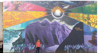
Lana'i HS students painted this mural with the help of the non-profit 808 Urban.