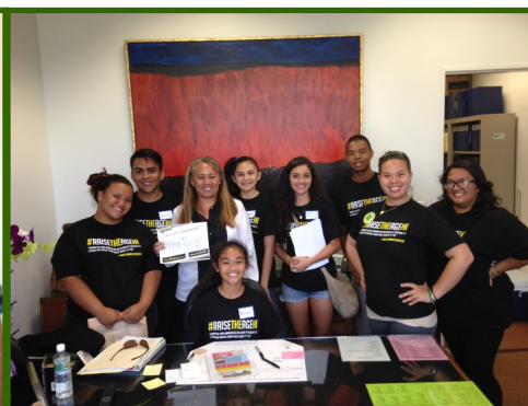
Maui County students from the Coalition for a Tobacco Free Hawaii on “Kick Butts Day”.