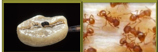
Top: Inspecting damage from the macadamia felted coccid on trees in Ka'u. Bottom left: Adult Coffee Berry Borer on a green coffee bean. Bottom right: Funds allocated to HISC will fight many invasive species such as the Little Fire Ant. Rep. recently worked with the Dept. of Agriculture and The Nature Conservancy in order to address a Little Fire Ant outbreak at the County Park in Na'alehu.

warranted it should be done on a national (and not a state-by-state) basis. A recent 2013 poll by the New York Times found that 93% of respondents favored the labels. I would like to hear from you, my constituents, on this issue as it will definitely be revisited next session.