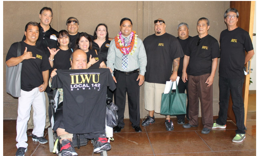
Picture to the right: ILWU members and Pacific Beach Hotel employees with Rep. Aquino