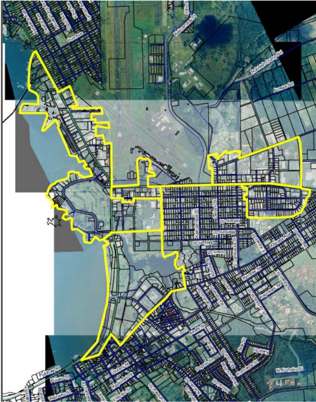
Hilo Community Economic District under Act 149, Session Laws of Hawaii 2018