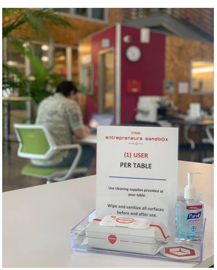
New social distance protocols April 2020