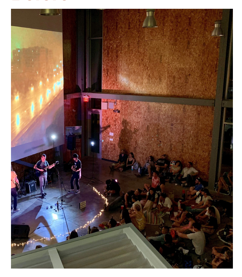
SoFar Sounds concert August 2019