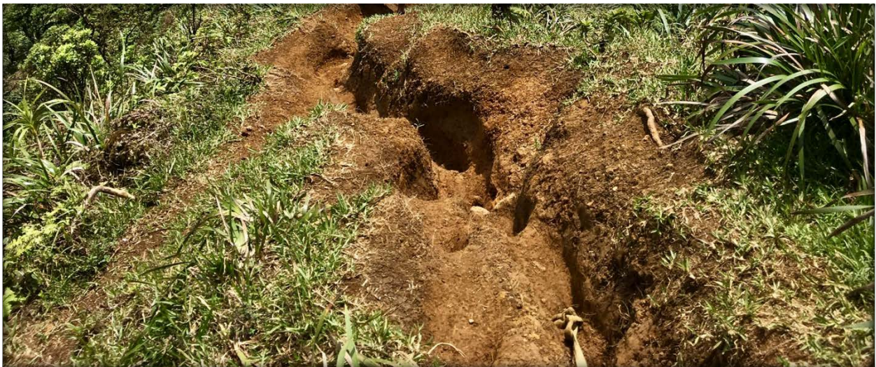
Deep rutting in the trail tread is apparent from over-use and lack of maintenance

When the approved CIP Program Plan funds are released, the new plan will incorporate these modern trail design guidelines and will provide the program with clearer direction on how to