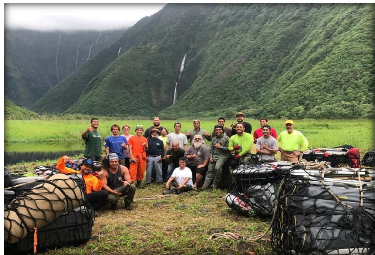
Na Ala Hele staff and volunteers flown in to Waimanu Valley for remote trail maintenance work

Manukā Loop trail, and trails at Kaheāwai, Humu'ula, Pu'u 'Ō'ō, Kaluakauka, Ala Kahakai, Pu'u Huluhulu, Puna, Onomea, Kaūmana, Muliwai, Kahauale'a, and Pololū. Brushing, tree removal, sign maintenance, helicopter support, and reconstruction make up the bulk of the work. Maintenance is also done on facilities, including 'Āinapo Cabin, halfway shelters along Muliwai trail, and Waimanu campsite, and various trailhead composting units. Due to Rapid 'Ōhi'a Death affecting Hawai'i Island, boot-cleaning stations installed at all trailheads are routinely cleaned and maintained, and program staff attended several outreach events to spread awareness of measures outdoor recreationalists can take to help protect forest health.