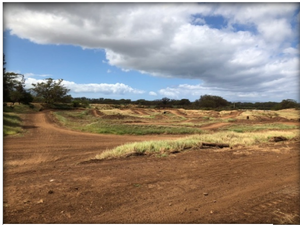
Photo of Maui Motocross Track

Monthly inspections of the bicycle features, signs, and trail maintenance continue by staff funded by a federal Recreational Trails Program fund. Staff funded by state general funds completed routine standard trail maintenance procedures, including brushing, grading, water diversion maintenance, tree and brush removal, and sign maintenance to the following trails: Haleakalā Ridge, Ala Loa O Maui, Hoapili Trail, Lahaina Pali, Plum, Poli Poli, Tie, Redwood, Mamane, Upper Waiohuli, Boundary, Lower Waiohuli, Waiakoa Loop, Waihe'e Ridge, Waihou Spring, Waikamoi Ridge, Ohai Loop, Keanae Arboretum, and Hulopoe-Huawai fisherman's trail on the island of Lāna'i. Maui staff has continued to provide maintenance support of the Maui Motocross Track, including landscaping maintenance, removing rubbish and debris, hauling materials, port-a-pot servicing, and equipment maintenance. Because the Na Ala Hele federally funded positions are unable to administer cutting, digging, or spraying until environmental compliancy for Section 7 and Section 106 is finalized, projects are back-logged and staff are struggling to keep trails up to standard specifications designed to meet safety requirements.