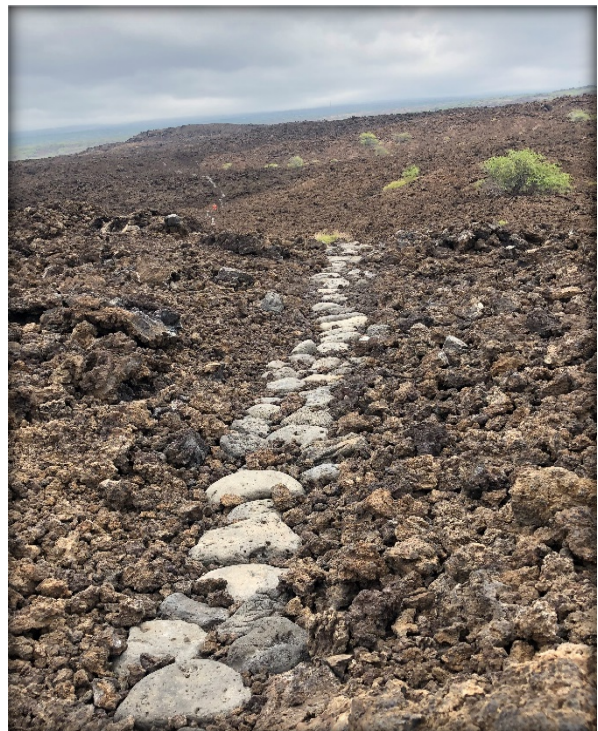
Stepping Stone Trail

Top left photo is a segment of the Ala Kahakai on Hawai'i Island. An abstract has been complete for the segment and it is now recognized as a National Historic Trail. The trail is identified as a 175-mile corridor and trail network. Many segments of this historic route have not received a thorough abstract due to limited program funding and staff capacity. The Stepping Stone Trail seen in above is an example of a portion that has yet been abstracted therefore not adopted by Na Ala Hele trails program. Increased staff and funding would allow the program to better protect and manage these amazing cultural and historically significant trails statewide.