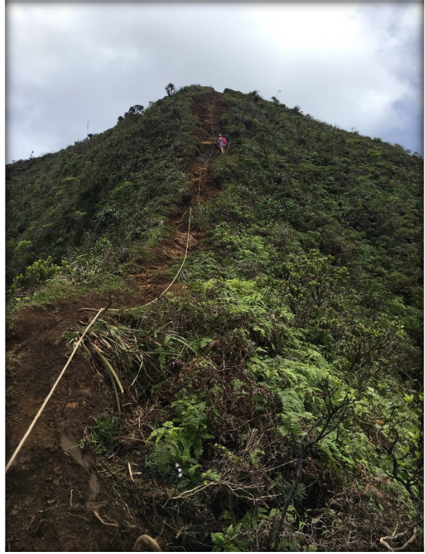
Photo captures excessive vegetation and soil erosion