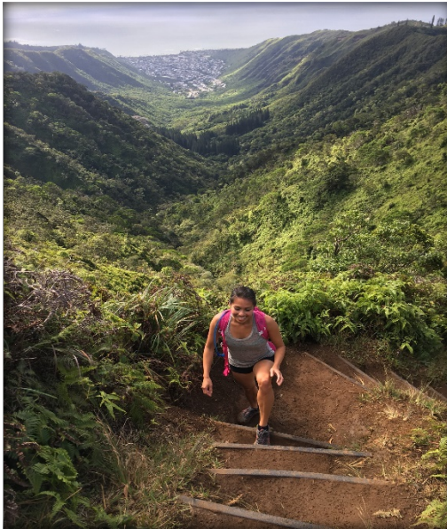
Wiliwilinui functional stairs

The photos below were captured on Wiliwilinui Trail. This is one of many high use summit trails leading to the ridgetop of the Ko'olau's that reward hikers with panoramic views of Oahu.