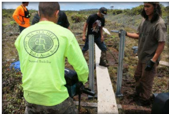
Na Ala Hele Staff constructing the Alaka'i Swamp Boardwalk

Kaua'i: The Kaua'i Na Ala Hele Advisory Committee scheduled 1 meetings in FY 2020, with the priority focus to provide safe outdoor experiences through proper management and maintenance of Kauai's trails and access routes. Repairing the Alaka'i trail boardwalk has been a major undertaking: 15 hours of helicopter flight time was used removing old boards and flying in new boards to continue repairs to the boardwalk so the public can access the area without destroying the fragile native ecosystem. Routine maintenance on Awa'awapuhi and Nu'alolo trails included brush control and grubbing narrow sections. The sharp increase of use of these trails has prompted more maintenance than in years past. Trail personnel spent three weeks removing downed trees that fell across trails during strong winds in January. They also did hazard tree assessments to identify other trees that should be trimmed or removed for safety reasons.