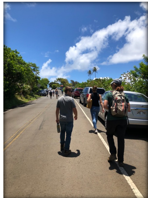
Congestion of both vehicles and hikers on the highway leading to Pololū trailhead

post COVID-19, has resulted in traffic congestion, and health and safety risks. Inadequate parking spots and no restrooms, results in vehicles parked throughout the community neighborhoods interfering with residential driveways and highway corridors.