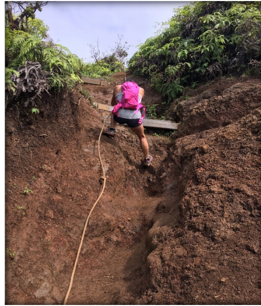
Deferred maintenance leading to design failure

Lack of program funding and limited staff capacity has not allowed the Department to address many deferred maintenance tasks resulting in some design and specification failures, as seen in the upper right photo, which become safety concerns. Na Ala Hele trails are increasingly stressed, and maintenance cannot keep pace with the growing demand due to inadequate funding. The lack of funding to provide needed, routine maintenance threatens public access and could endanger the public safety if funding does not keep pace with public visitation.