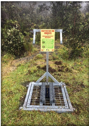
Rapid Ohia boot brush station installed at all Hawaii Islands Na Ala hele trailheads

Trail specialists on Hawai'i Island are responsible for maintaining and expanding the Waiākea ATV and Dirt Bike Park, as well as maintenance of the Mauna Kea ATV riding area (roads R1, R10). Routine maintenance is ongoing, including minor grading, signage, and trash. Routine trail maintenance and improvements include 'Āinapō trail and road, Mauna Loa Observatory Road,