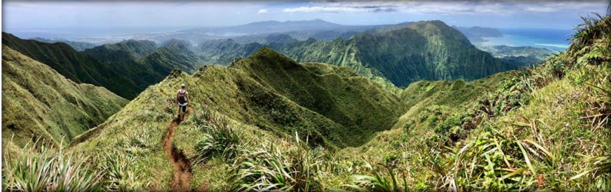
Na Ala Hele Program Manager collecting trail inventory data on O'ahu

Chapter 198D, Hawaii Revised Statutes (HRS), creates the Hawaii Trail and Access System, under the Department of Land and Natural Resources (DLNR). Pursuant to Section 198D-9, HRS, a report is required to highlight DLNR's accomplishments in Fiscal Year (FY) 2019.