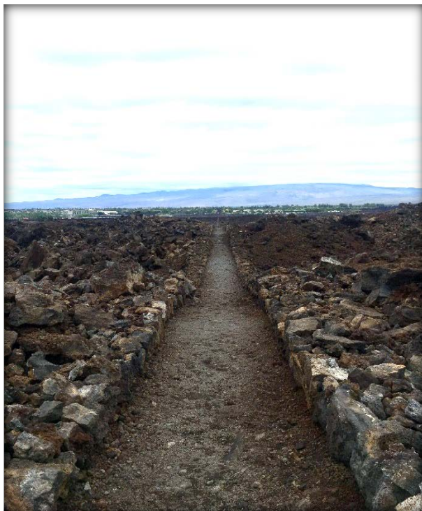
Ala Kahakai Trail

Of the 33 files opened in the last year, about a third were done at the request of DOFAW staff regarding trail and access issues, a third from other agencies in reference to possible historic trails through private lands, and a third from the Attorney General's office for responses to civil actions.