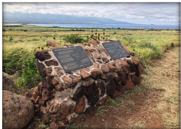
Trailhead signage at Lahaina Pali Trail

Hawai'i: The Kaulana Manu Nature Trail project is a popular native forest area off Daniel K. Inouye Highway where users can experience native plants and animals in a pristine setting, is developing into a visitor attraction. A Capital Improvement Project is finishing construction on a new parking lot, bathrooms, and interpretive signage. At Pololū, program staff have been working closely with private landowners near the Pololū trailhead to negotiate a land donation that would allow construction of a parking lot and restroom facility to service trail users flocking to the area. Capital Improvement Project funds (to be released in 2021) have been approved to develop plans for this project.