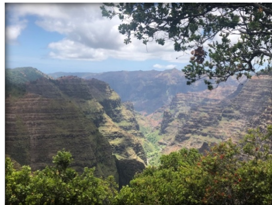
View found at the end of Poomau Canyon Vista Trail, Kauai