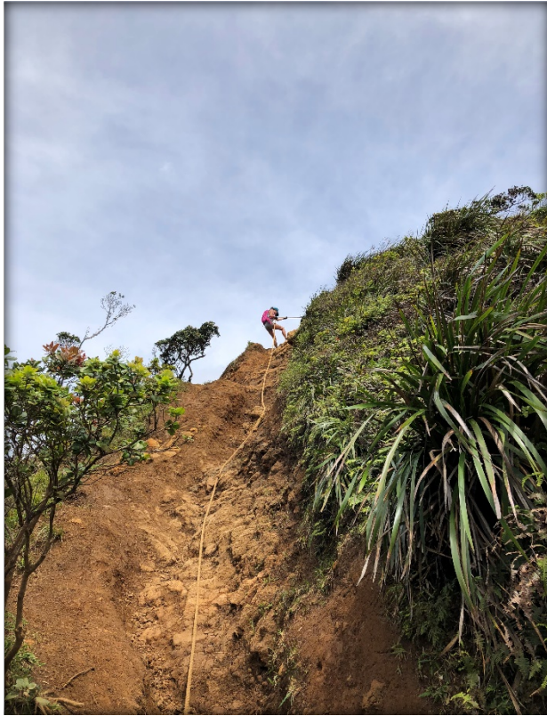
This shows a user created alignment with too steep of a grade, resulting in tread failure

The photographs below represent informal routes developed over time that have not received the application of trail design principles. Natural resource damage such as vegetation loss and soil erosion are the result, not to mention the elevated user safety risks.