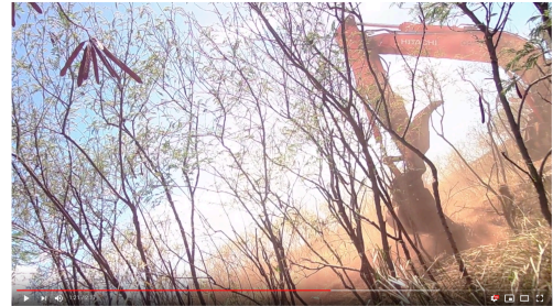
The Taking of Hanehane Gulch / Pueo Country

https://www.youtube.com/watch?v=QoE1bdaqUvg