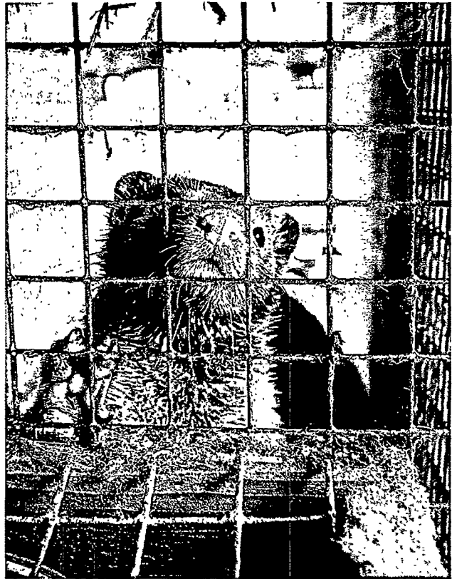
Fur factory farms are responsible for the suffering of millions of animals.

Humane alternatives exist. After going fur-free in 2016, Giorgio Armani said, “technological progress made over the years allows us to have valid alternatives at our disposal that render the use of cruel practices unnecessary as regards animals.” Michael Kors went fur-free the following year saying, “due to technological advances in fabrications, we now have the ability to create a luxe aesthetic using non-animal fur.” This sentiment has spread across the fashion industry, as major fashion brands have switched to innovative materials that have the look and feel of animal fur but without the cruelty. Also, fur bans are helping drive the demand for innovation leading to a more sustainable and cruelty-free future.