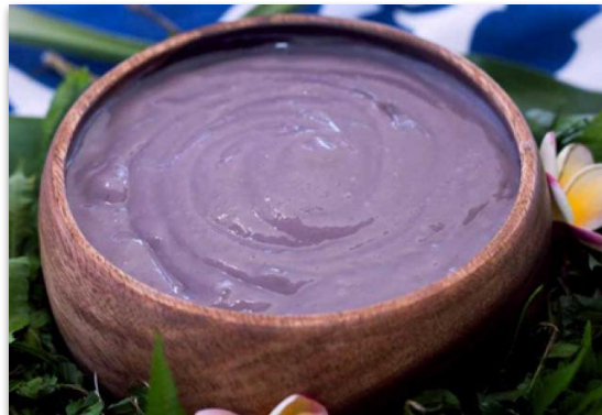
My first food was poi. -Kualau '24