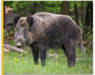
My favorite thing to do is hunt -Ethan '24