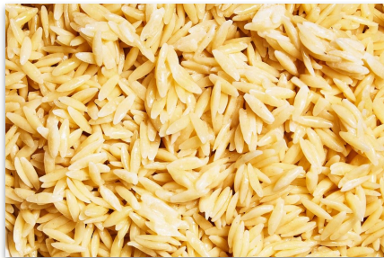
My favorite food is orzo pasta. We are Italian. -Castle- '24