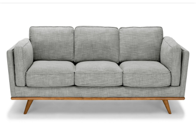
I usually eat meals on the couch because it is comfortable. -Devin '24