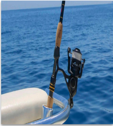
I like to fish and fish is something I like to eat -Oakley '24

We Support farm to school and ask you to consider the following important bills: