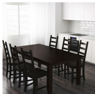
My family always eats dinner at the table because it's a way for all of us to come together at the end of a day. -Keenan Lam '24