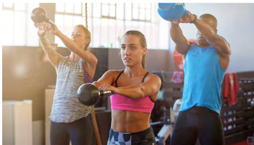
HMSA Active & Fit Program https://hmsa.com/well-being/active-and-fit/

If adding to an insurance rider it would require the business (kumu hula) to have a Tax ID, agreement to use the online platform to manage participation and usually receive a slightly lower reimbursement than private pay. Other restrictions may apply. If hula were added to HMSA 365, the kumu hula would require recognition by the Better Business Bureau of Hawaii or a copy of their business certificate.