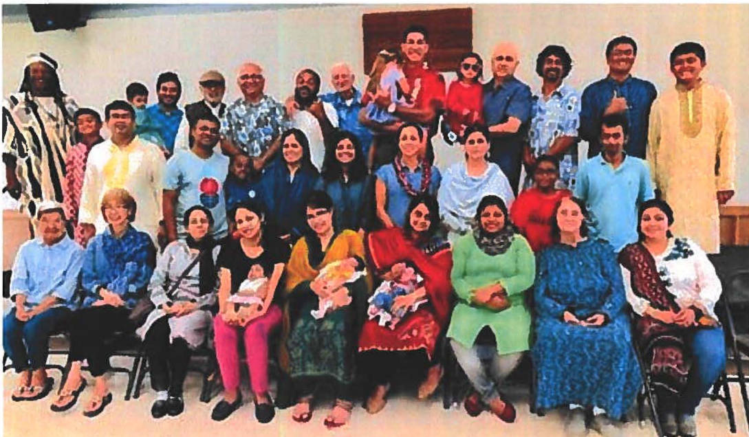
Islamic Center of Hawaii - Eid Celebration - August 2019 - Hilo, Hawaii

The Islamic Center of Hawaii aims to collaborate with the University of Hawaii-Hilo that is located across the street from the facility. In addition to hosting many international students from Muslim countries who come to Hilo, Hawaii to study, the community has been active in assisting with teaching and researching topics in Islam. Currently, we are in the process of building the first official Islamic Center of Hawaii on the Big Island, which will include a mosque, cemetery, and community room. As of now, there is no other congregational Friday Jumma prayer service on the Big Island of Hawaii. Currently, we do not hold other prayers congregationally except for the Friday Jumma prayer.