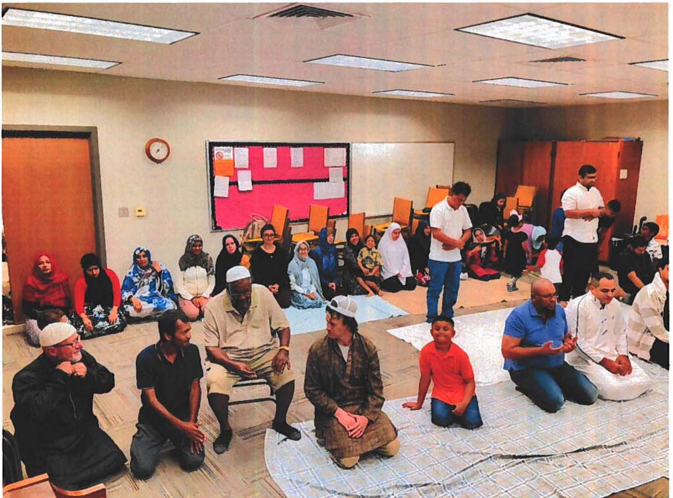
Islamic Center of Hawaii – Friday Jummah Prayer Services - Hilo, Hawaii