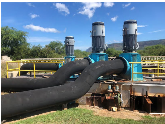
Kawaiele Pump Station

A critical function is pumping excess groundwater to the ocean to prevent the Mana Plains, including the town of Kekaha, from flooding. Under a contract with the Pacific Missile Range Facility Barking Sands, a range of 5 to 20 mgd is pumped.