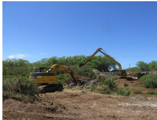
Dredging Drainage Ditches