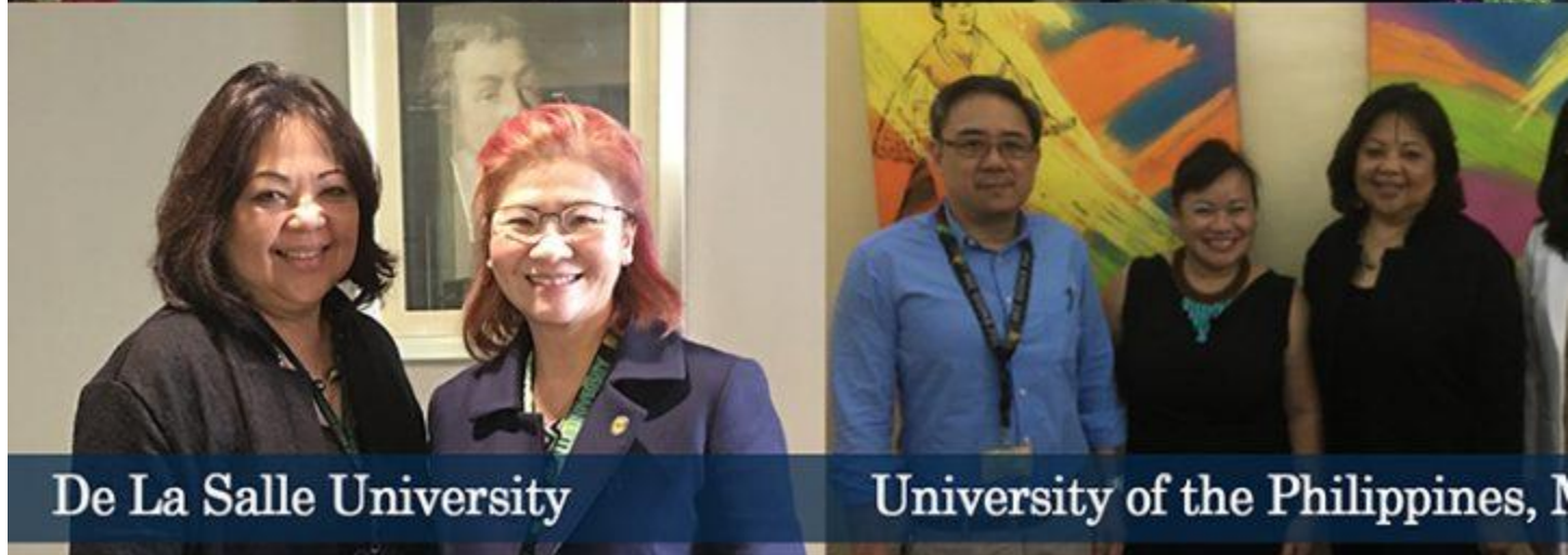
De La Salle University