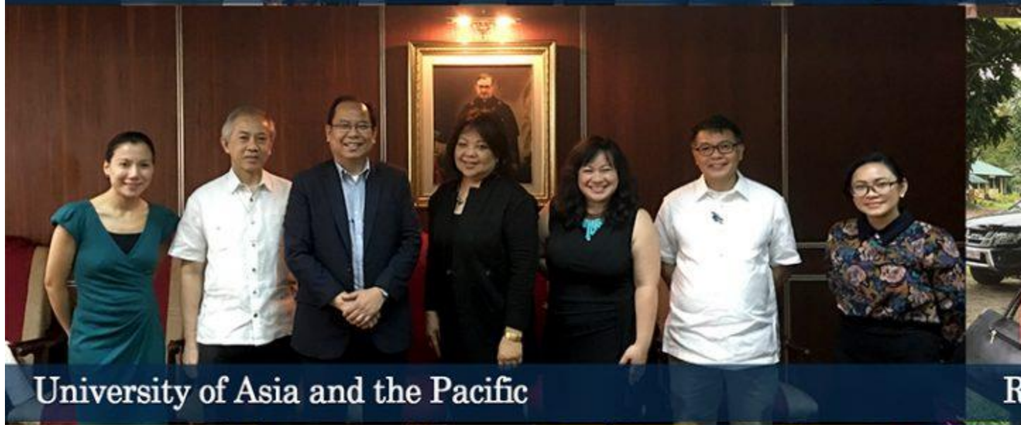
University of Asia and the Pacific