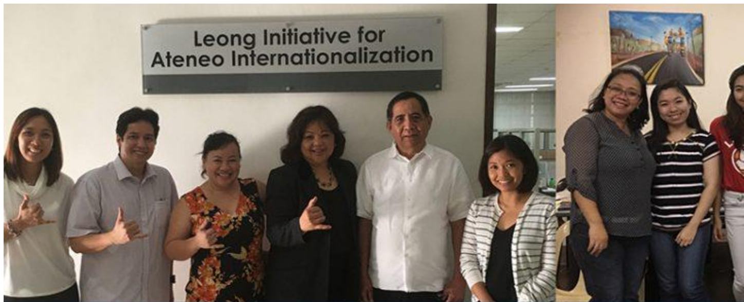
Ateneo De Manila University