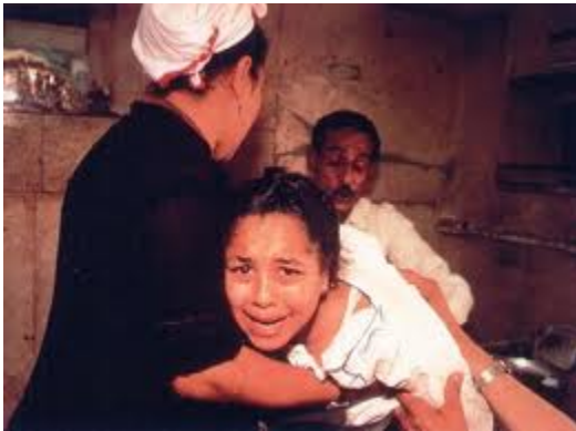
2. Preparing the patient for the FGM