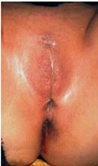
3. Finished procedure