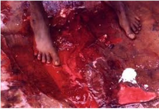
4. Aftermath from the procedure