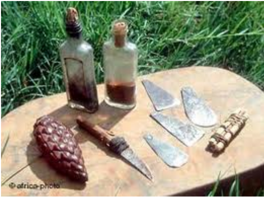
1. Utensils used in FGM