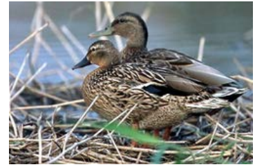
Koloa Maoli or Hawaiian Duck, endemic to the Hawaiian Islands.

ITL Duration: The ITL is valid from December 5, 2001 to December 4, 2100; the SHA period is from December 5, 2001 to December 4, 2021.