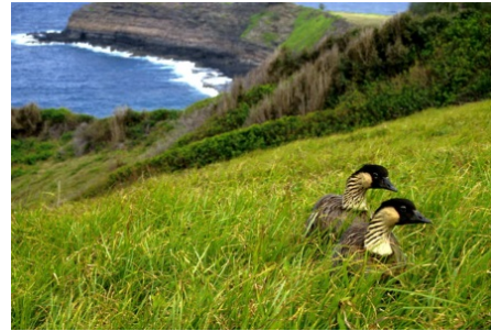
Nēnē, official bird of the State of Hawai‘i, resting in the foreground.

ITL Duration: September 4, 2001 – September 3, 2008 (The Department of Land and Natural Resources’ (DLNR) Division of Forestry and Wildlife (DOFAW) is currently in discussion with Pu‘u o Hōkū Ranch to enter into a new agreement).