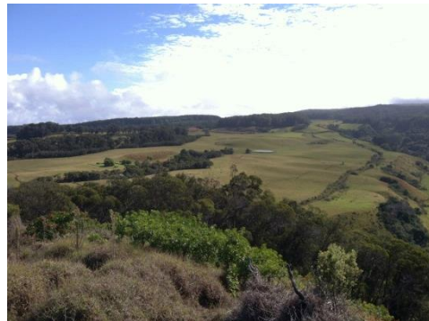
Pi‘iholo Ranch on Maui.

ITL Duration: The ITL is valid for 50 years from September 21, 2004 to September 20, 2054; the SHA period was from September 21, 2004 to September 20, 2014 (DOFAW is currently in discussion with Pi‘iholo Ranch to enter into a new agreement).