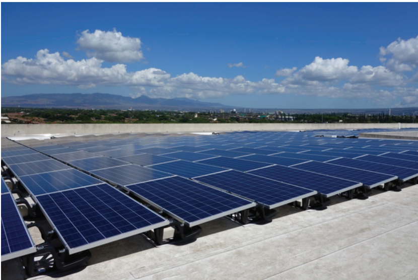
Photovoltaic panels on HNL rooftop, looking 'Ewa