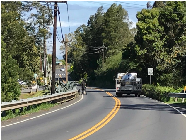
Mother with baby stroller & dog on Haleakala Hwy near Ainakula Road

I urge you to help make our neighborhood safer.