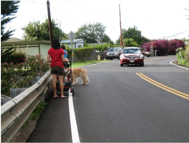
Two adults with baby stroller and dog on Haleakala Hwy at Kimo Drive

I have been concerned about the safety of pedestrians walking along the shoulder of Haleakala Highway between Ainakula Road and Kimo Drive. This portion of the highway runs through a residential district where pedestrians walk to work, walk to the Kula Market Place, walk to the school bus stop, walk their dog or just go for a walk around the neighborhood. Haleakala Highway connects the neighborhood creating a popular circuitous route. Unfortunately there is very limited shoulder to keep pedestrians off the road where the guardrails are located. Motorists do not pay attention to the 30 mph speed limit. As the residential population increases in this neighborhood as well as the traffic increase it is just a matter of time before someone gets injured.