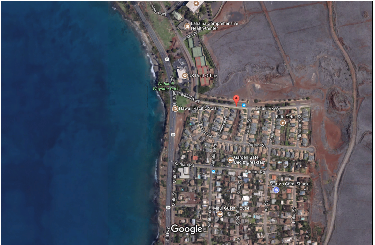
United States 200 ft