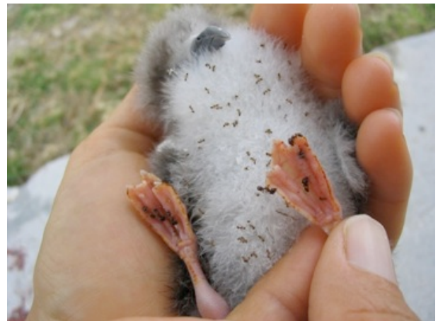
Invasive ants on wedge-tailed shearwater chick.

Telephone/Fax: 808.593.0255 | email: info@conservehi.org | web: www.conservehi.org