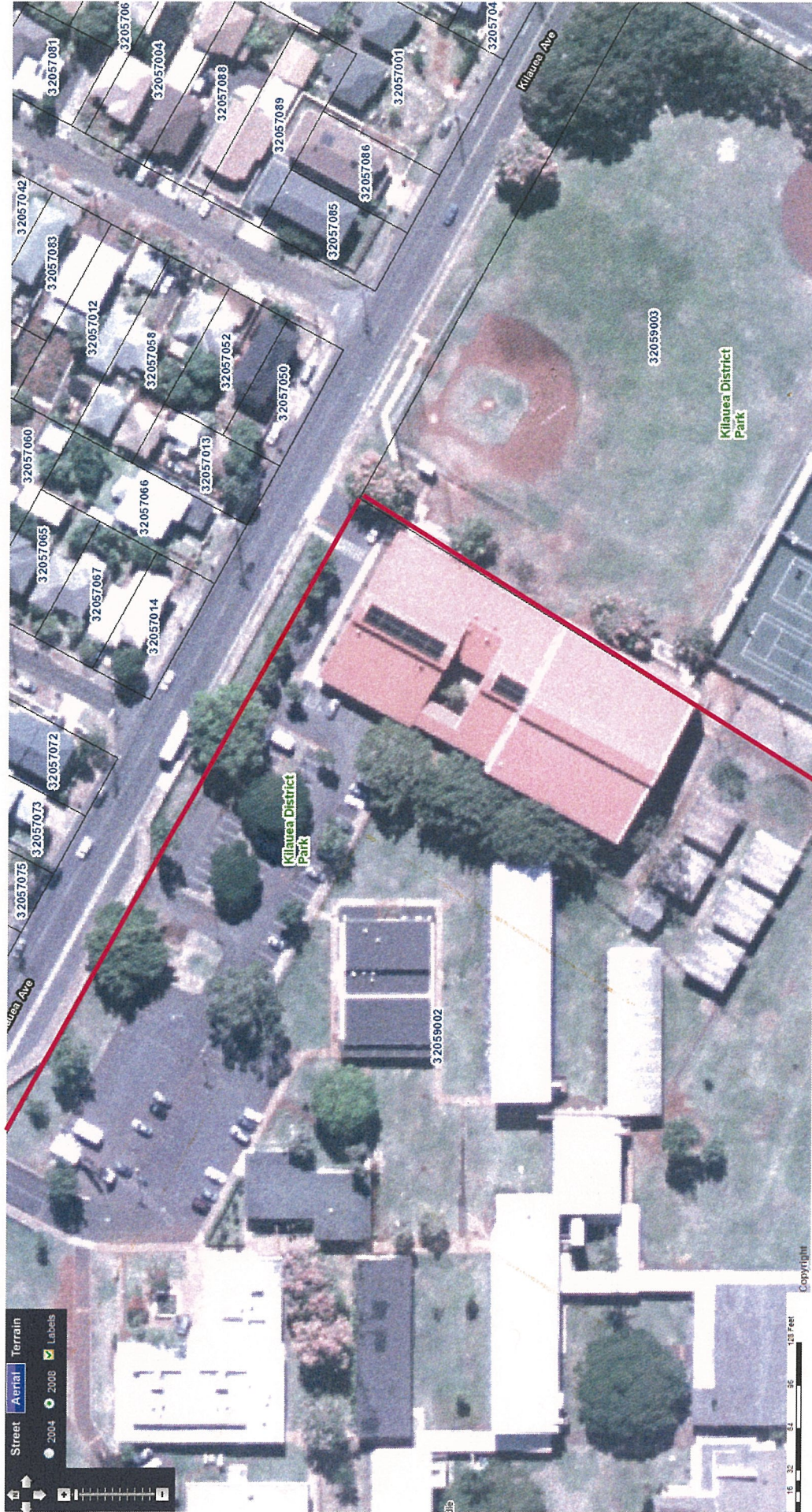
SB 2237, SD1 Relating to Public Schools (59) TMK 3-2-059-002 (Kaimuki Intermediate School) IMPACT: Loss of Kilauea Gymnasium, located next to Kilauea District Park