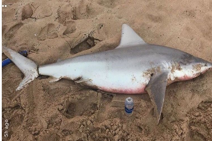
These sharks were found dead at Waimea Bay around Sept. 2017 where there were large bait balls occurring inside Waimea Bay and sharks were spotted feeding on them. It's not known if the men in the left photo were the ones that killed the shark (via Instagram under @kala__grace). The female sandbar shark on the right was found after presumably being dragged on shore with the rope around her tail and tied to a sand spike.