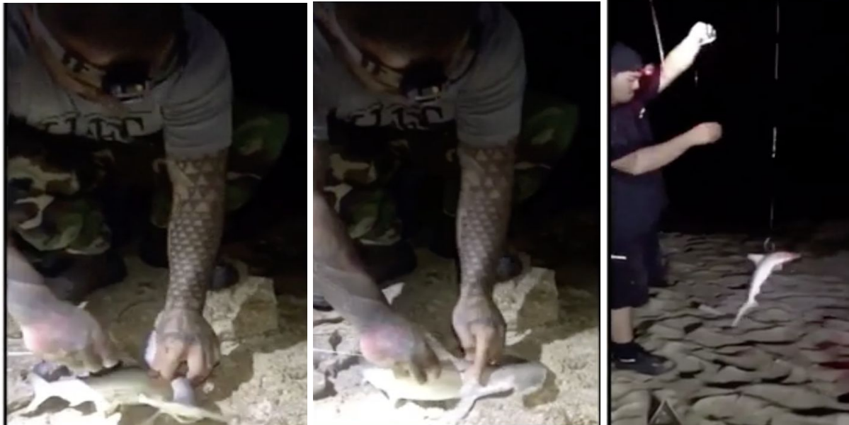
Man using a juvenile hammerhead as bait. In video the dialogue is "Guys, isn't that hammerhead?" "Yeah." "Aren't you supposed to let it go?" "Are you silly? I'm still gonna send it.". The shark was still alive and struggling, as seen in the first two screenshots.