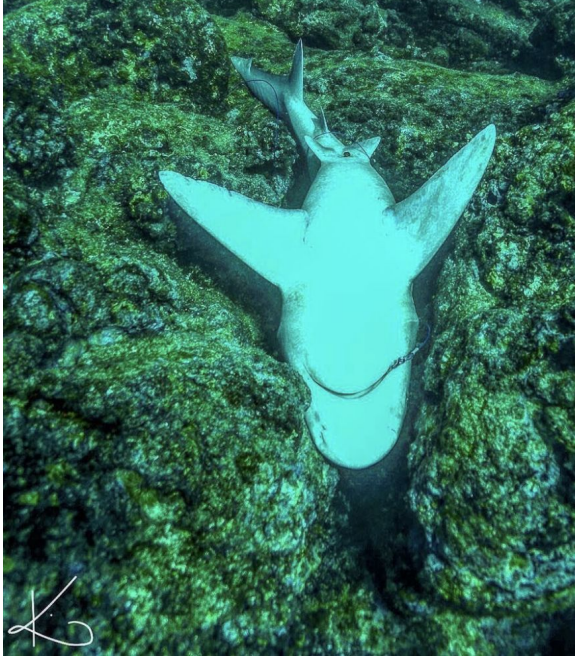
A sandbar shark found dead on the West Side Dec 2017