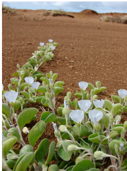
Pa'u o Hi'iaka on Kaho'olawe