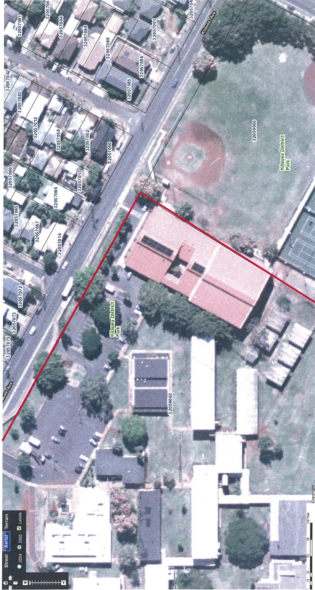
SB 2237, SD1 Relating to Public Schools (59) TMK 3-2—059-002 (Kaimuki Intermediate School) Impact: Loss of Kilauea Gymnasium, located next to Kilauea District Park