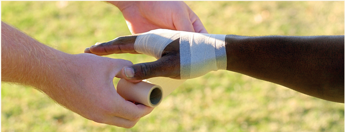
Exhibit 1 What an Athletic Trainer Does

MOST HAWAII ATHLETIC TRAINERS work in secondary schools; however, other work settings include universities, hospitals, and clinics. Every Department of Education (DOE) high school has at least one athletic trainer.