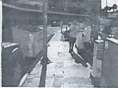
Volunteers pulled 4 tons of trash from Ala Wai Harbor

"I saw plastic bags in the ocean and started picking them up, and ended up filling my