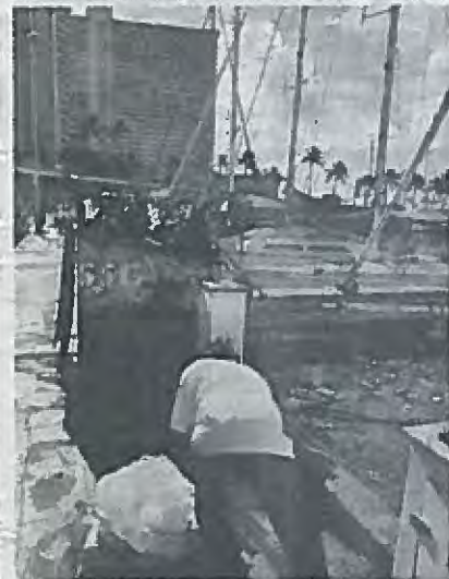
Debris was checked the harbor