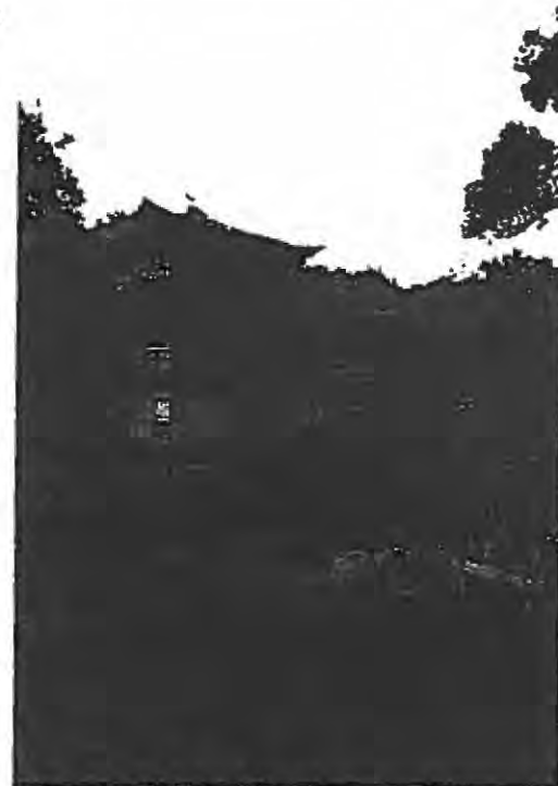
Full view of Kinkaku-ji Temple

The Honolulu Pagoda is architecturally significant for three reasons: it was designed with the original proportions of the Nara Pagoda and uses the bracketing construction techniques found in the traditional design; it is the largest pagoda ever built; and it incorporates new construction techniques using concrete and steel. The Sanju-Pagoda is 1 ½ times larger model of a pagoda located on the grounds of the Minami Hoke-ji Temple in Nara, Japan, built in the Momoyama