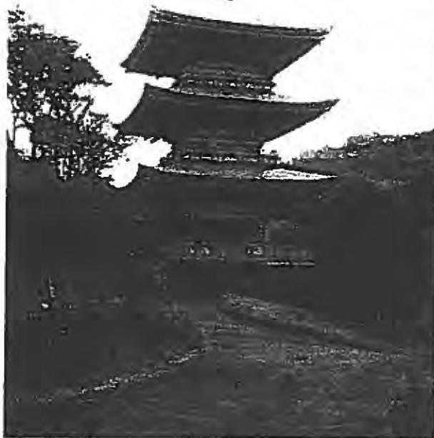
View of pagoda National Register collection; photo by David Franzen

Period (1571-1602). Its height from the foundation to the top of the roof, not including the ku-rin copper spire is 80', the total height, including its spire is 116'. The Kinkaku-ji columbarium models itself after the world-famous Kinkaku-ji located on the grounds of the Roku-on-ji Temple in Kyoto, built in the Muromachi Period (1335-1573) Style. The Kinkaku-ji columbarium is a three-story steel-framed and plaster finish columbarium. The height of the building measures approximately 38' high, not including the phoenix finial at its roof peak. The gentle roof slope form and less formal eave and kumimono structure are historic and architecturally significant forms that are indicators of the later temple style.