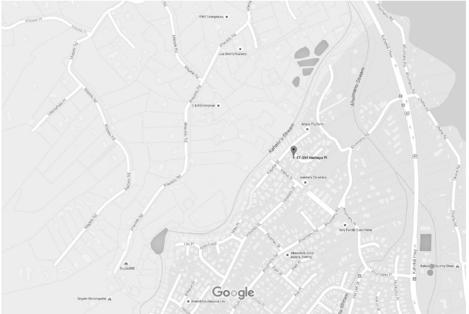
200 ft