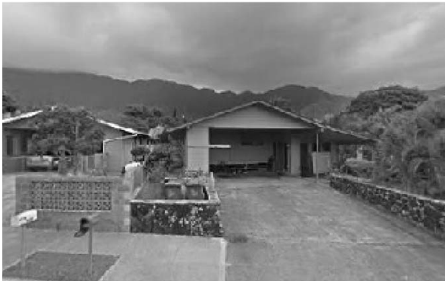
47-394 Keohapa Pl Kaneohe, HI 96744