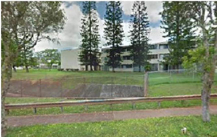
94-946 Meheula Pkwy Mililani, HI 96789