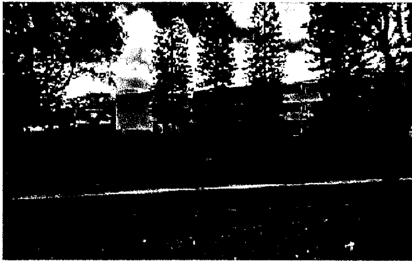
94-946 Meheula Pkwy Millani, HI 96789