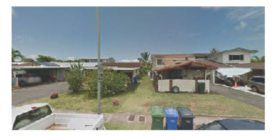
41-659 Inoaole St Waimanalo, HI 96795