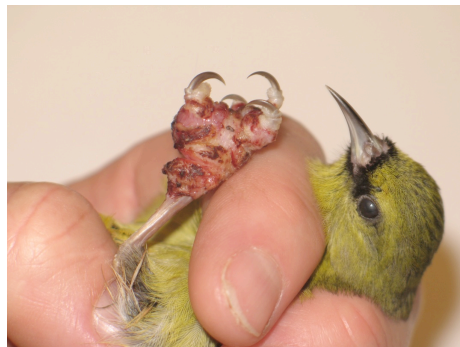
'Amakihi with avian pox lesions.