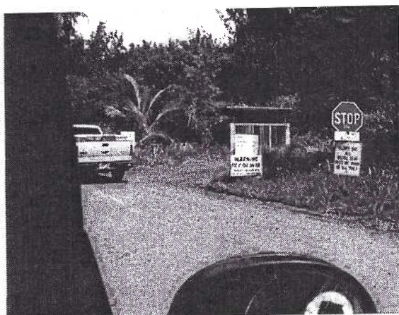
Non functional water pump at entrance