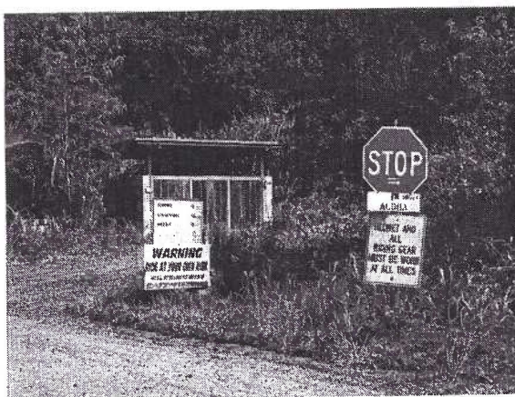
Signs by non functional water pump

Onsite inspection of Hawaii Motorsport Association on 05/12/2016