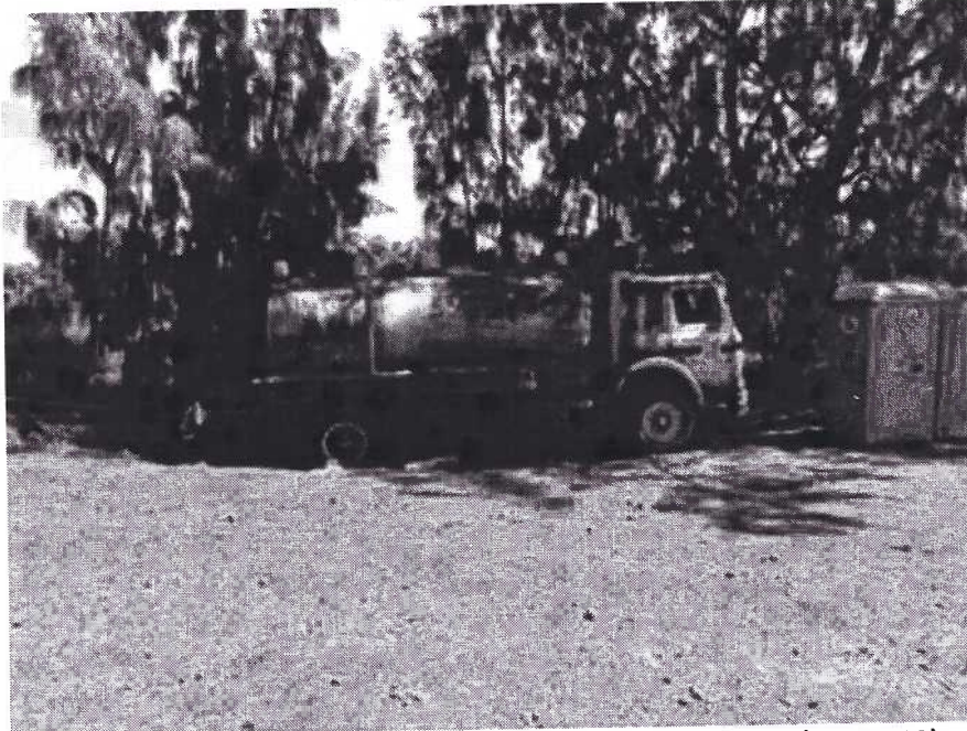
Water Truck #1

Truck was abandoned after a broken leaf spring, ( minor repair $ 1,000.00) and left to junk.