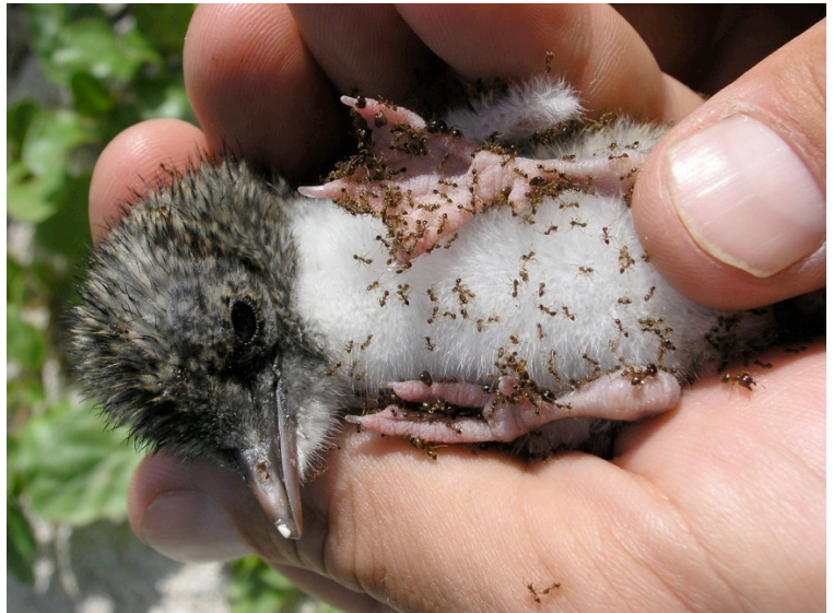
Ants attacking sooty tern chick