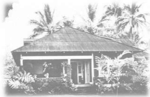
Halehuki circa 1940

Now MGH aims to apply navigation services to patients with other chronic diseases