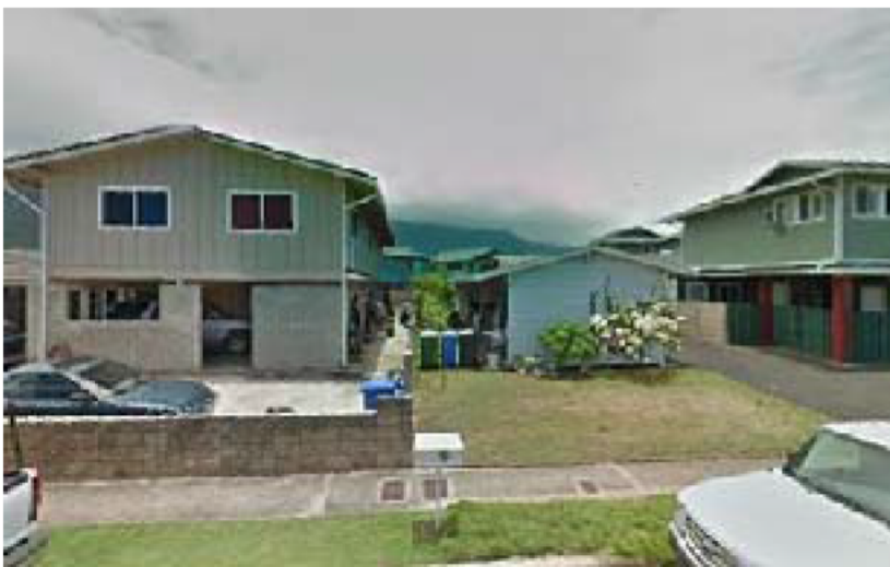
41-652 Inoaole St Waimanalo, HI 96795