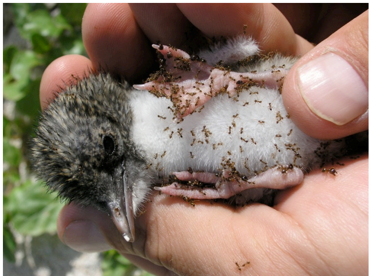
Ants attacking sooty tern chick