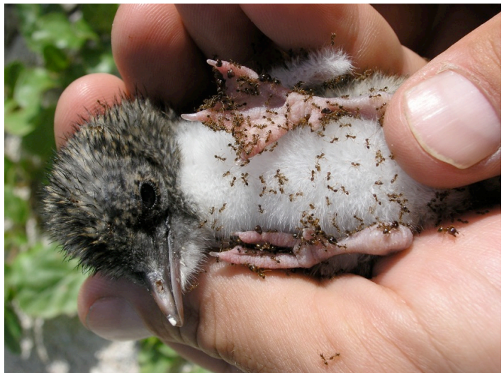
Ants attacking sooty tern chick