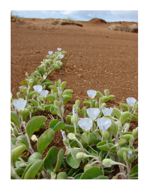
Pa'u o Hi'iaka on Kaho'olawe