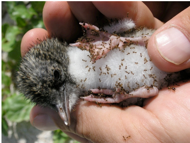
Invasive big-headed ants attack wedge-tailed shearwater chick