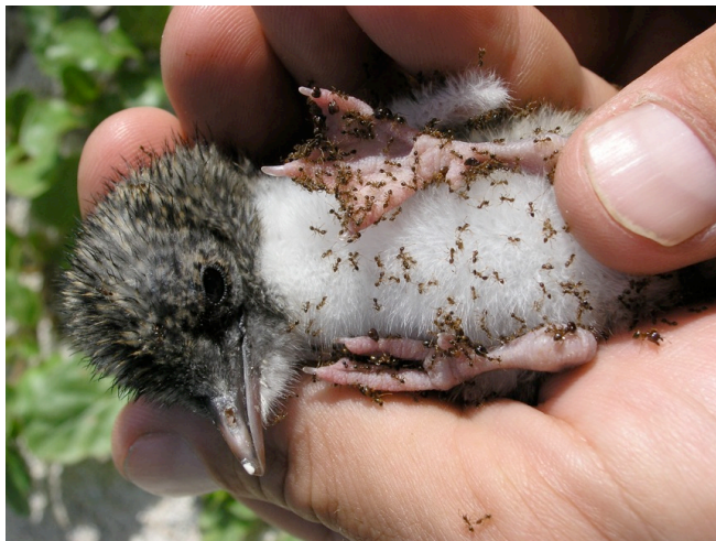
Invasive big-headed ants attack wedge-tailed shearwater chick

Telephone/Fax: 808.593.0255 | email: info@conservehi.org | web: www@conservehi.org