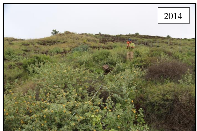
East Moloka'i Watershed Partnership area before and after fencing and animal management.