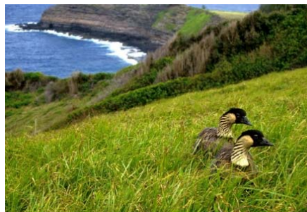
Nēnē, official bird of the State of Hawai‘i, resting in the foreground.

Take Authorization: Incidental take of Nēnē on lands owned or otherwise controlled by Pu‘u o Hōkū Ranch, Limited.