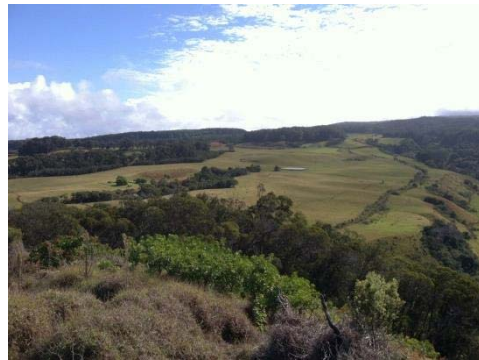
Pi‘iholo Ranch on Maui.

Take Authorization: Incidental take of Nēnē on lands owned or otherwise controlled by Pi‘iholo Ranch, LLC.