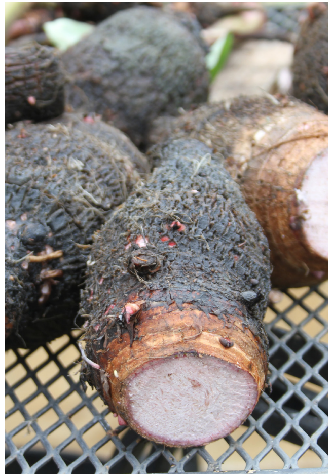
Freshly-harvested taro.