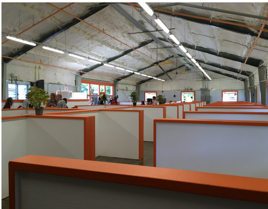
The Family Assessment Center opened in September in a former maintenance shed at the Kakaako Waterfront Park. It is expected to serve 400 people over two years.

In addition to supporting the Family Assessment Center that was developed on lands held by the Authority, discussed above. The Authority also funds a job training program, which gives a hand up to homeless individuals willing to provide peer outreach along with janitorial and beautification services for Authority-owned parks in Kakaako.