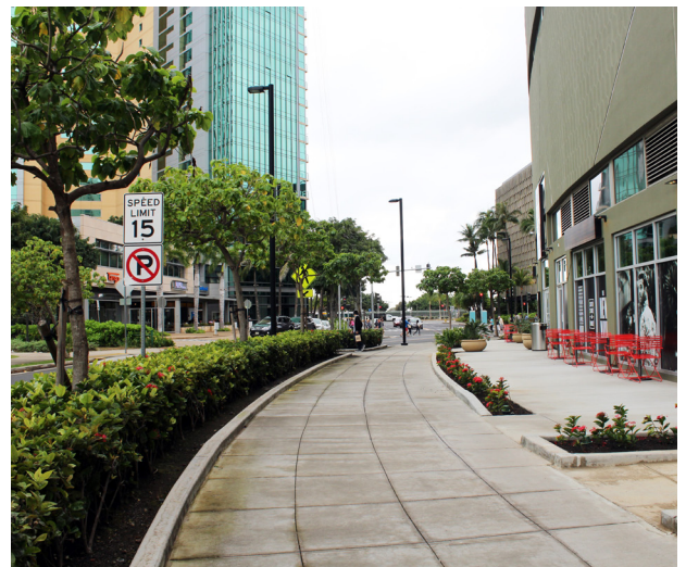
Left: Restaurants at Ward Village Shops along Auahi Street offer outdoor dining. Right: South Shore Market at Ward Village Shops features wider walkways and seating for customers to enjoy food and beverages.