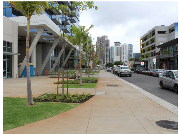
Top: At The Collection, the project is “wrapped” with commercial uses and townhomes. Middle: Wider sidewalks and landscaping contribute to a more open feel between The Collection and SALT at Our Kakaako.