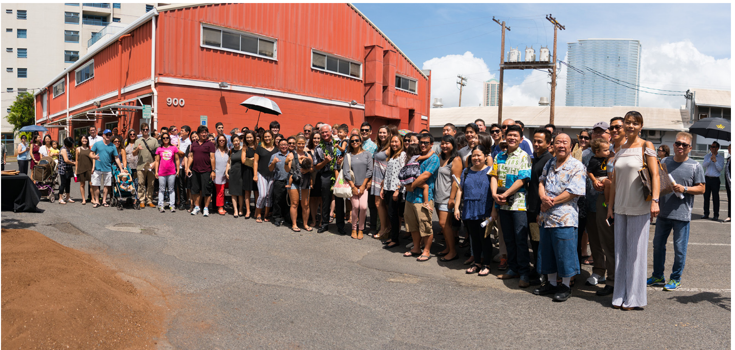
Future Ke Kilohana residents attend a groundbreaking ceremony. Ke Kilohana will have 375 Reserved Housing units. The project is expected to be completed in 2018.

For more information on the Reserved Housing program and to view the rules governing it, please visit our website at www.hcdaweb.org