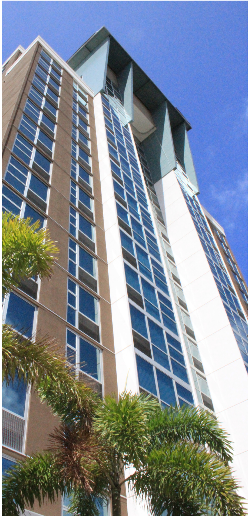
Halekauwila Place is a low income housing project. The Authority contributed $17 million to the project.