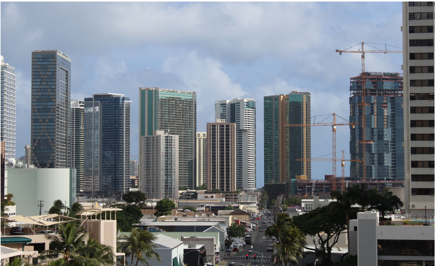
Kakaako skyline.