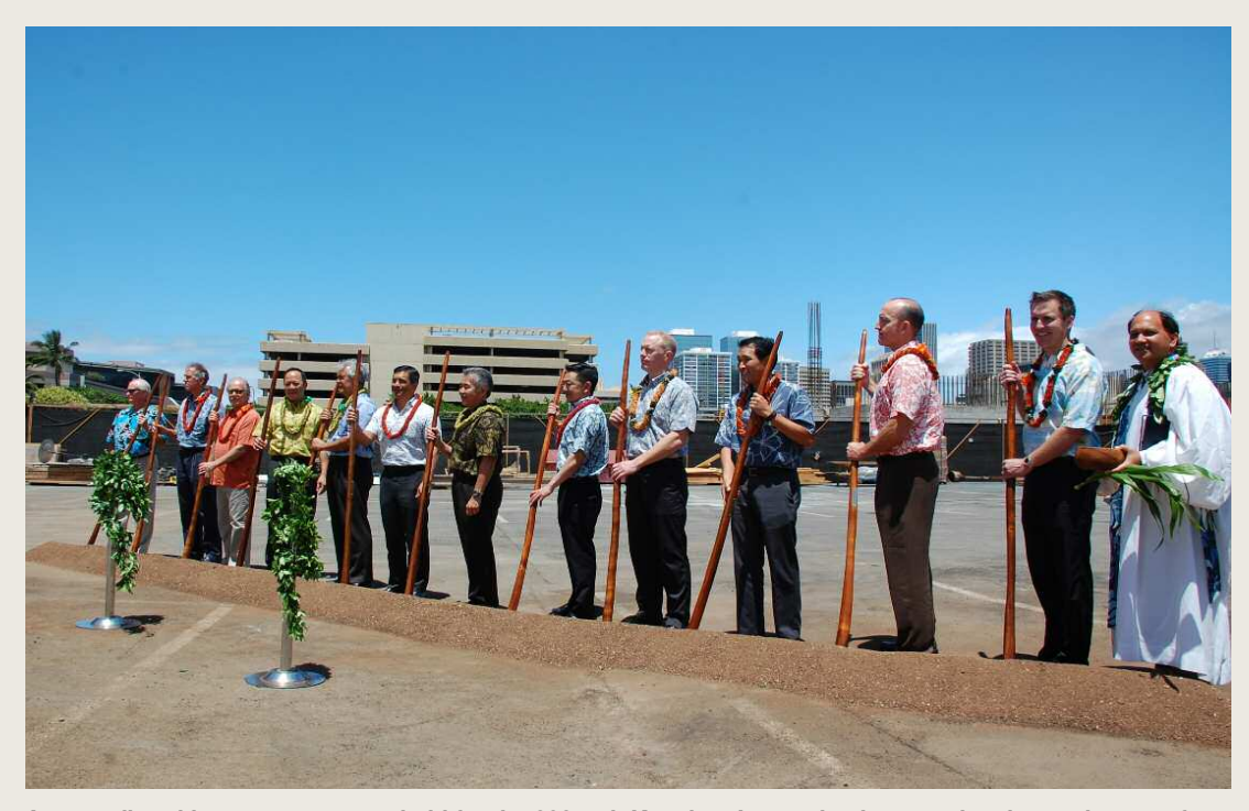
A groundbreaking ceremony was held for the 209-unit Keauhou Lane mixed-use project located across from the Honolulu Rapid Transit Authority's Civic Center Rail Station in Kakaako.

Keauhou Lane will include a blend of studios, one- and two-bedroom rentals, and 32,300 square feet of restaurant and retail space with 280 parking spaces. A pedestrian paseo will connect Keauhou Lane and Keauhou Place to the Honolulu Rapid Transit Authority's Civic Center Station.