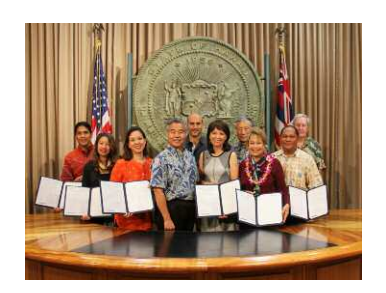
In 2016, Act 131 broadened the HHFDC's ability to develop mixed-use developments to help create communities with housing, jobs, shops, and government services located in close proximity. It also facilitates broader-scaled interagency partnerships with State and County departments and agencies for housing developments on state and county lands.