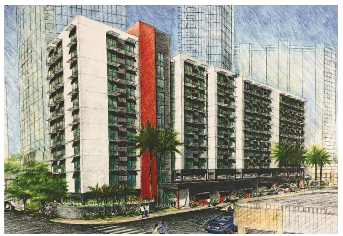
Hale Kewalo 128-unit rental near the HART Ala Moana Station

Hale Mahaolu Ewalu Phase I – 39-unit senior rental project in Pukalani, Maui. The one, two and three -bedroom units are targeted at seniors earning 30 to 60 percent of AMI. Developer - Hale Mahaolu Ewalu LP - LIHTC/RHRF/DURF