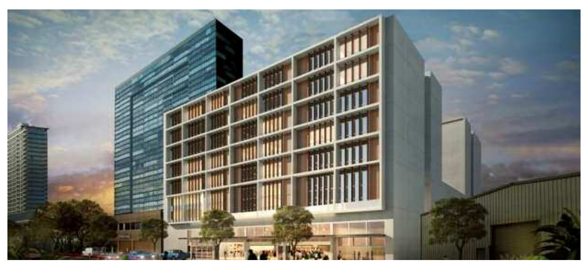
Artspace 84-unit mixed use development in Kakaako near the HART Ala Moana Center Station

Hale Ohana – 180-unit for-sale project in McCully. The project consists of 78 studio, 87 one-bedroom and 15 two-bedroom units targeted at buyers earning 80 to 120 percent of AMI. Developer - MJF Development Corporation - DURF/201H