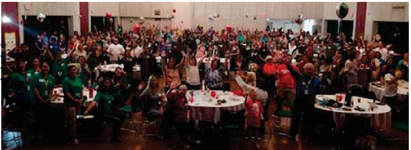
SPIN Conference goers celebrated a moment of togetherness at lunch.